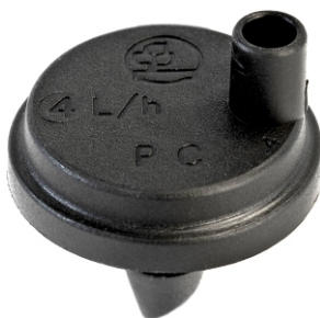
Agri Drip™ PC Dripper Barb 4 mm