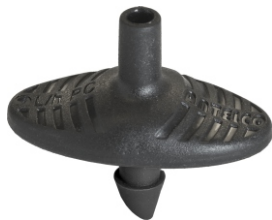
Pinch Drip™ PC 4 lph Barb 4 mm