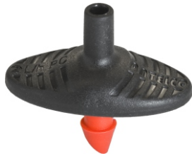
Pinch Drip™ PC 2 lph Barb 4 mm