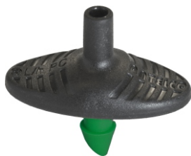
Pinch Drip™ PC 8 lph Barb 4 mm