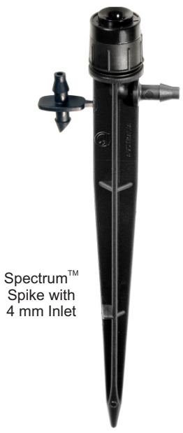
Spectrum™ Spike with 4 mm Inlet