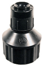
Spectrum™ Thread 1/2" FNPT