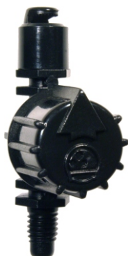
Vari-Jet™ 180° fan 10-32 UNF Thread (4 mm)

* Ghosted figures indicate a change of performance from spray to mist.