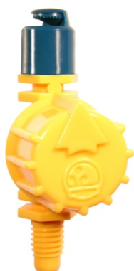
Vari-Jet™ 180° fan 10-32 UNF Thread (4 mm)